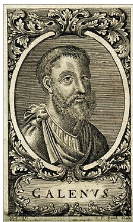
Galen of Pergamon Most accomplished of all medical researchers of antiquity