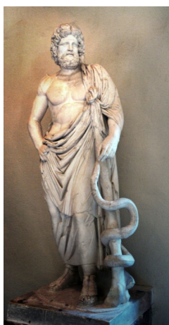
Asclepius Greek God of Medicine

Enjoy this magnificent journey for only $3,599 per person, plus air transportation. You can arrange your own round-trip flight to Greece or contact White Star Travel (1-800-437-2323) in Reading, PA to make the arrangements for you.