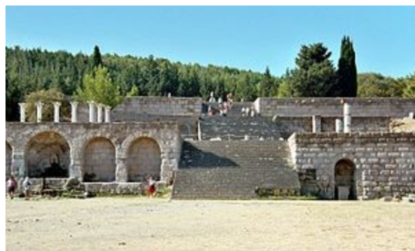
Asclepeion of Kos Hippocrates' school of medicine & hospital